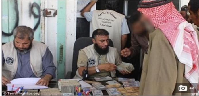
Charity? The propaganda shots show jihadis handing out cash to members of the public at a dole office

What's concerning is extremists often use images, videos and music that young people and children will know or like in their posts online and then link this to their information. This often presents changed information to present it as their own cause.